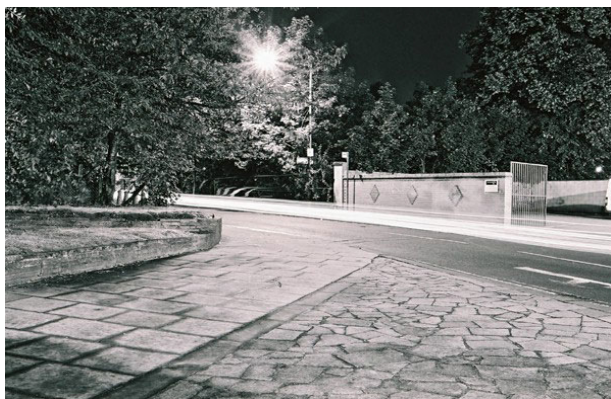
avenue / dual

In this series of eight b/w photographs, I have been influenced by a stretch of landscape that has been designated for potential re-development. The work continues themes of an ideal landscape and place, but uses the concept of an Avenue as a barrier, coming through the emptiness of the image. The work was exhibited as part of a group exhibition called 'Groundswell' in 2003 as four photographs and two video pieces.