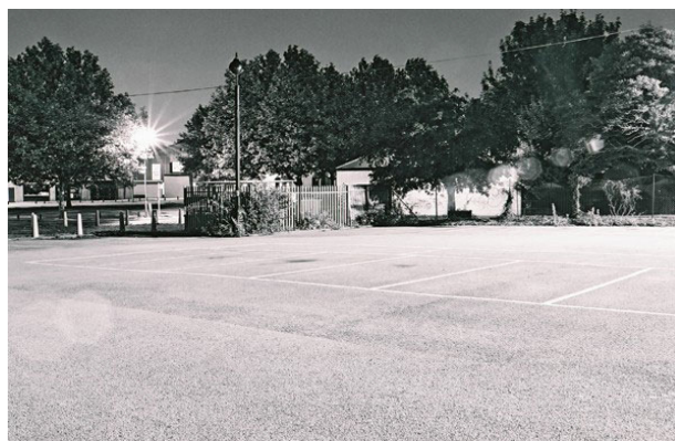
avenue / village